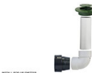
INSTALL POP-UP EMITTER

Using a corrugated pipe adapter, connect a drain pipe to one of the piped sections of EZ-Drain to create a discharge point. Connect the drain pipe to an elbow with a weep hole. The elbow should be installed with the weep hole on the horizontal side of the elbow. Slide the Pop-up Emitter onto the elbow. An additional length of pipe can be used between the elbow and Pop-Up Emitter to bring the Pop-up emitter to the surface. The Pop-Up Emitter fits on the "bell" or "hub" end of the pipe or a pipe coupler.