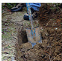
LAY OUT SYSTEM, DIG TRENCHES AND HOLES

Dig holes and trench for pipe, catch basin, Flo-Well, and EZ-Drain. Dry fit (no glue) the entire drainage system from the catch basin to the pop-up emitter. The Flo-Well and EZ-Drain should be installed at least 10' away from any existing structure. Measure and cut all pipe to necessary lengths. After completing each step, glue parts together.